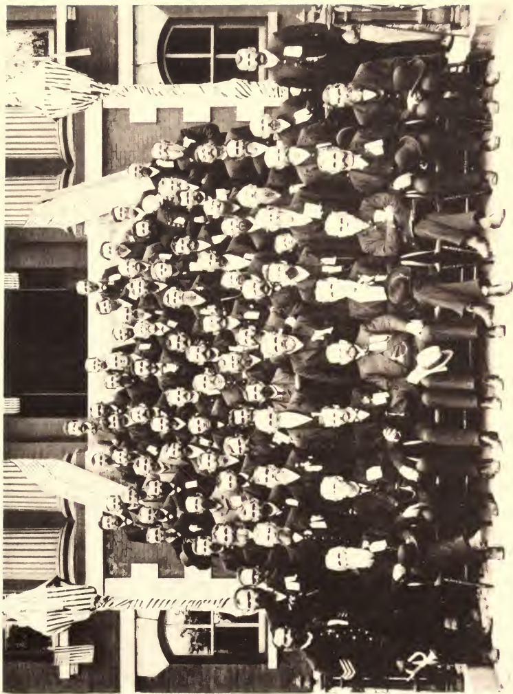
View of 104th Veterans in 1888